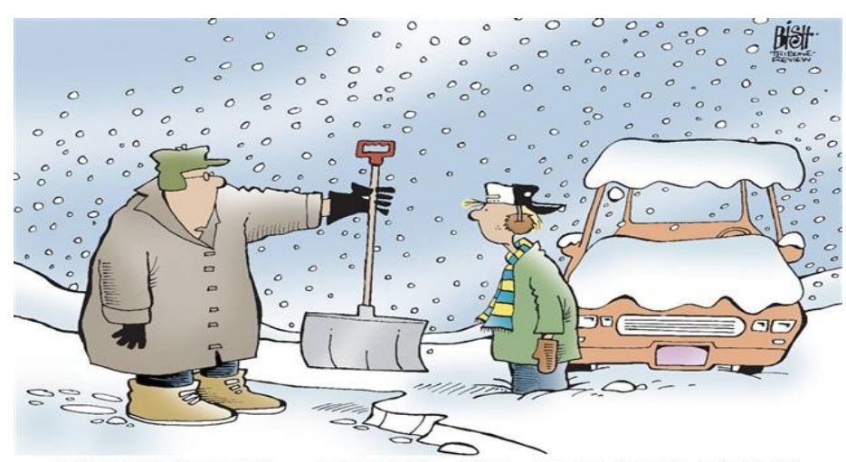
SORRY, SON...THERE'S NO APP FOR THAT

The pastor would appreciate it if the ladies of the congregation would lend him their electric girdles for the pancake breakfast next Sunday.