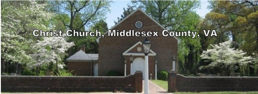
Christ Church, Middlesex County, VA

Please remember that we have a mid-week Eucharist here at Christ Church. The service is at 9:00 a.m. on Wednesday mornings and will be celebrated in the Chapel in the Parish Hall.