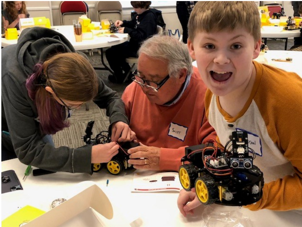
Our Junior Warden on January 15 with two of 11 enthusiastic girls and boys assembling robot cars during the Tech Team's Build-a-Robot Day. See other photos posted on the bulletin board in the Parish Hall.